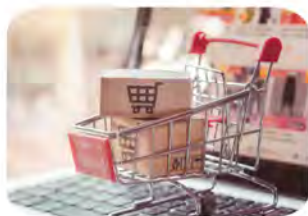
網店平台插件對接 (Plug-in) Plug-in for e-commerce platforms