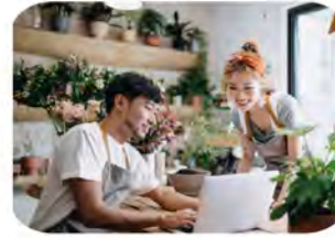
社交媒體/直播網店 (需要有網站) Social/ livestream commerce (Website required)