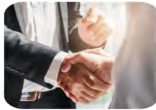
B2B/B2C服務收款 B2B/ B2C service fee