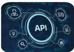
API接入網站或應用程式 API docs for website/app integration